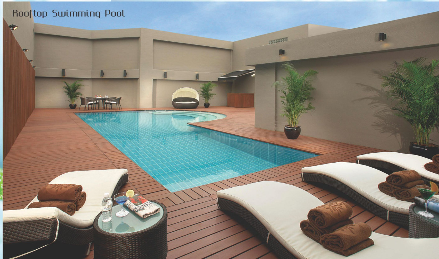
Rooftop Swimming Pool