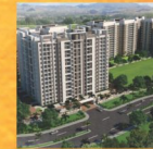
Coral City Neemrana (NCR)