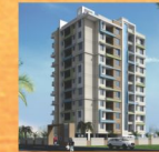
Coral Evoq Near Gyan Vihar, Jagatpura, Jaipur