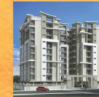
Coral Radha Krishna Green Triveni, Sikar Road, Jaipur