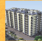
Coral Shubh Niwas New Navratna Complex, Bhuwana Road, Udaipur