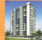
Coral Czar Budhi Vihar, Alwar