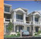
Coral Crimson Court Near SKIT, Jagatpura