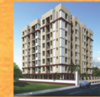
Coral Golf Green Near Air Force, Golf Course Scheme, Ratanade, Jodhpur