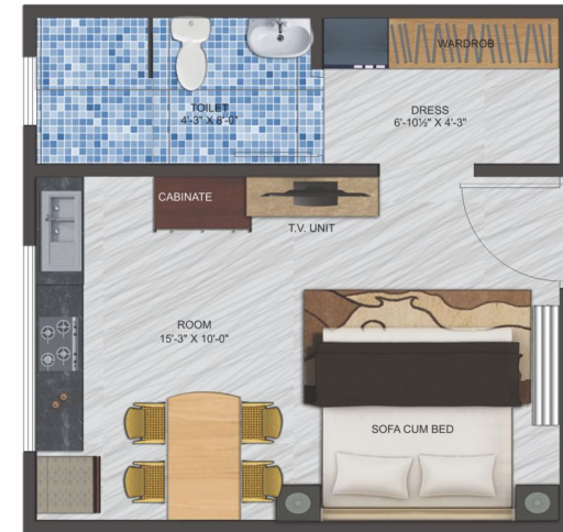
STUDIO Saleable Area = 320 BUA = SBUA - 25%