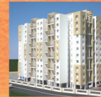
Coral Pune Chakan Industrial Area, Pune