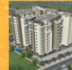
Coral Arianth Heights Patrakar Colony, Near Mansarovar, Jaipur