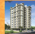
Coral Dhamu Patel Nagar, Bikaner