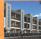
Coral Eshwar Old Shubani Road, Bikaner