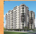
Coral Studio 2 Jagatpura Jaipur