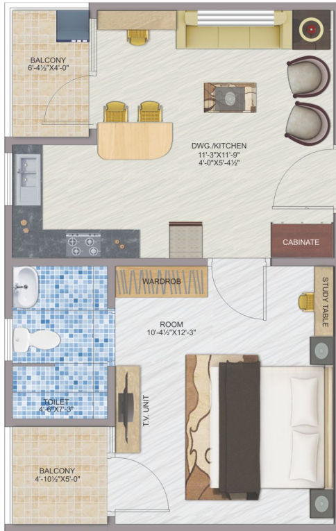
1BHK Saleable Area = 530 BUA = SBUA - 25%